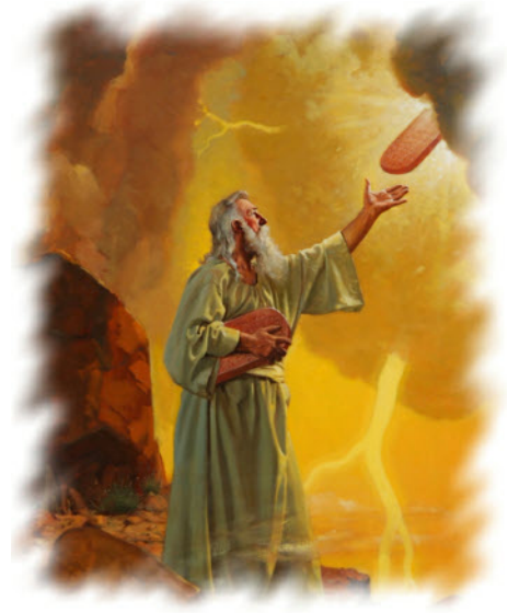
The prophet Moses gave God’s messages.

Before the Romans destroyed Jerusalem in AD 70, He warned the city of the destruction that was to take place. Christ Himself said these words, “And Jesus said unto them, See ye not all these things? Verily I