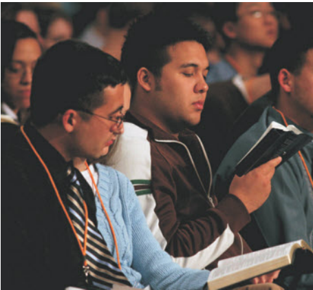
Test church teachings by the Bible.

If Jesus warned us that there would be false prophets in the last days, then how are we going to be able to distinguish between the false and the true? We’re told in Isaiah 8:20, “To the law and to the testimony: if they speak not according to this word, it is because there is no light in them.” We must compare everything with Scripture. We must study the Scripture to see if what