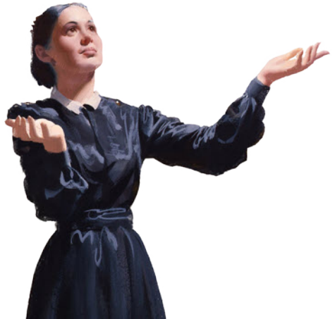
Ellen G. White presented inspired messages.

Scores of years later, the Sloan Kettering Institute for Cancer Research stated: “A virus has been linked with eight human cancers in findings he reported today. Dr. Wendell Stanley at the University of California, virologist and Nobel prize winner, stated that a virus is a miniature germ.”