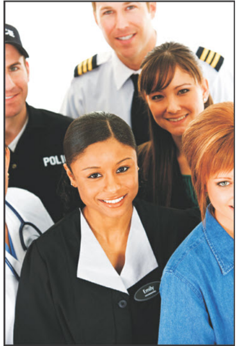
God gives His people differing talents.

Also in Ephesians 4:11-14, the apostle Paul, writing under the pen of inspiration, wrote, “And he gave some, apostles; and some, prophets; and some, evangelists; and some, pastors and teachers; For the perfecting of the saints, for the work of the ministry, for the edifying of the body of Christ: Till we all come in the unity of the faith, and of the knowledge of the Son of God, unto a perfect man, unto the measure of the stature of the fulness of Christ: That we henceforth be no more children,