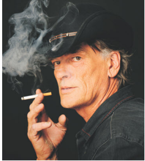
Tobacco is a slow deadly poison!

In the book Life Sketches she wrote, “... not long hence these cities will suffer under the judgments of God. San Francisco and Oakland are becoming as Sodom and Gomorrah, and the Lord will visit them in wrath.” Quite a statement, yet many believed her message and moved from the two cities specifically mentioned as the targets of God’s wrath (p. 412).