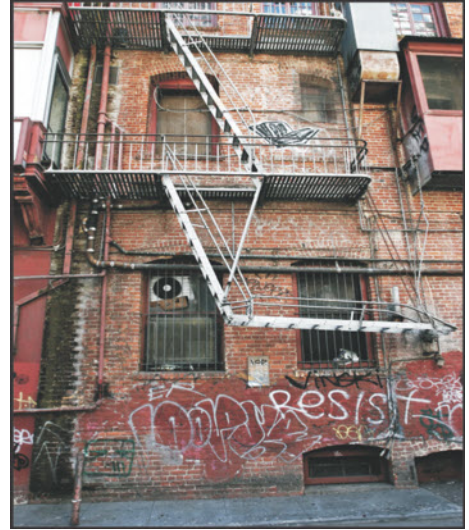
Poverty, moral corruption and crime are concentrated in cities.

“There are not many, even among educators and statesmen, who comprehend the causes that underlie the present state of society. Those who hold the reins of government are not able to solve the problems of moral corruption, poverty, pauperism, and increasing crime. They are struggling in vain to place business operations on a more secure basis. If men would give more heed to the teaching of God’s word, they would find a solution to the problems that perplex them” ( Testimonies Vol. 9, p. 13).