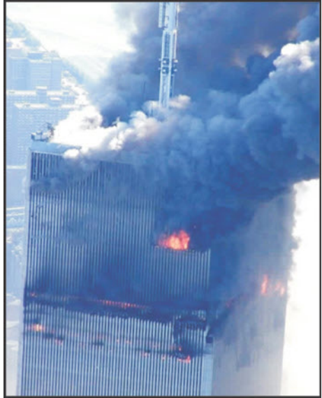
The twin towers turned out not to be fireproof.

Having been given a dream in the early 1900's, Ellen White wrote, “On one occasion, when in New York City, I was in the night season called upon to behold buildings rising story after story toward heaven. These buildings were war-